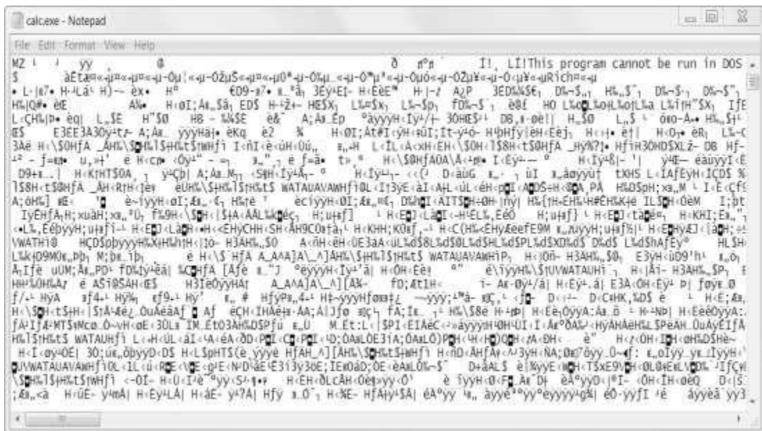
Figure: The Windows calc.exe program opened in Notepad