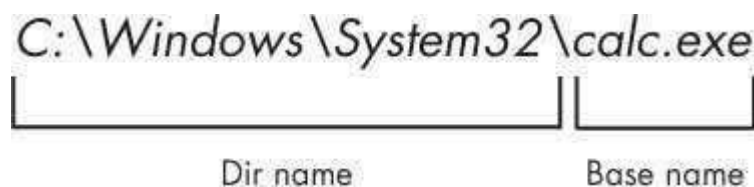
Figure: The base name follows the last slash in a path and is the same as the filename. The dirname is everything before the last slash.